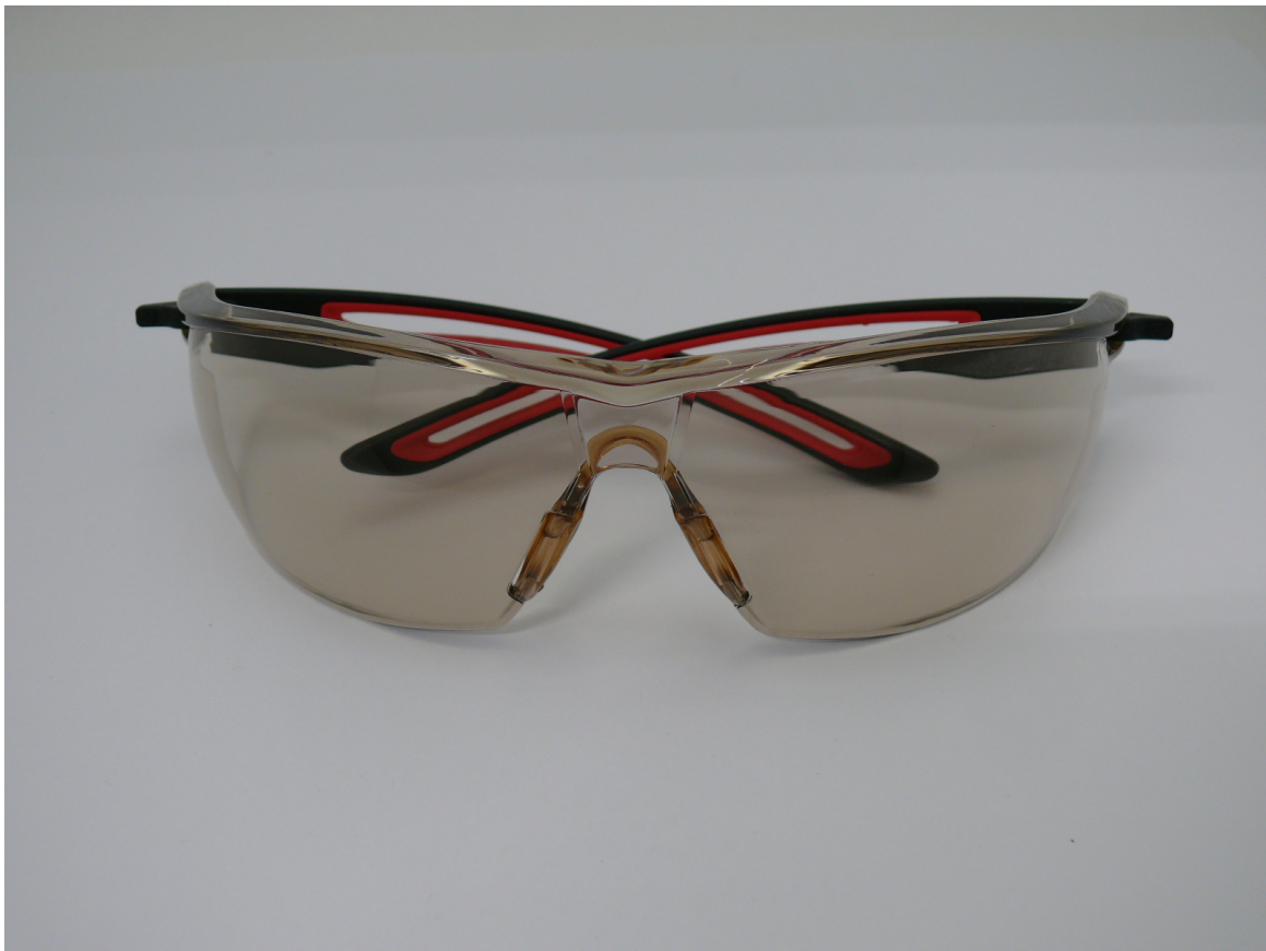
Figure 1: Specimen picture.